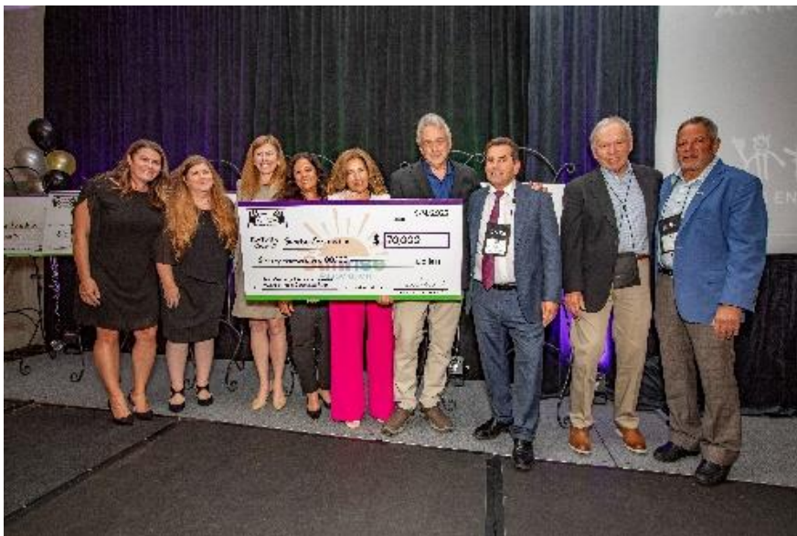
Sunrise Association donation, From L to R: