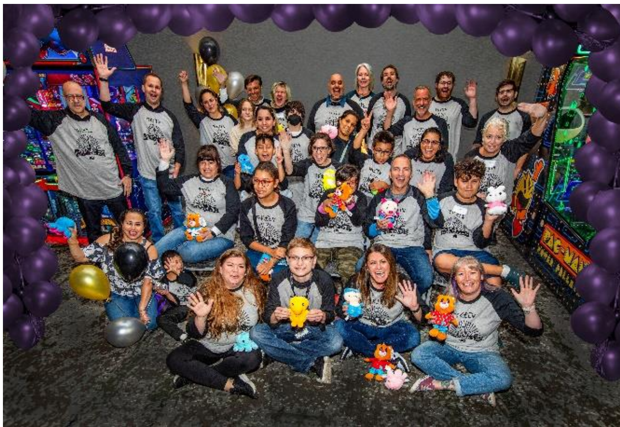
KEEN athletes, industry members and AAMA staff

American Amusement Machine Association 180 Detroit Street, Suite B | Cary, IL 60013 P: +1(847) 290-9088 www.coin-op.org