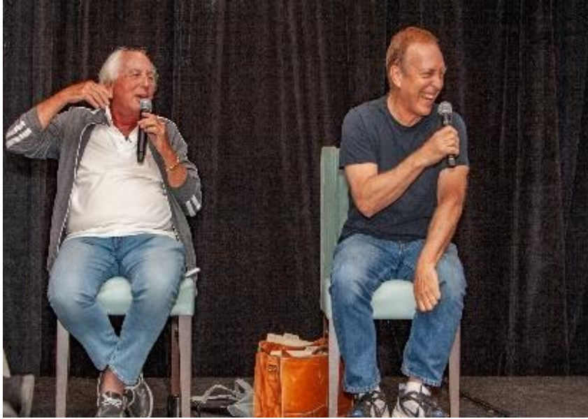
Hall of Fame Inductees, From left to right: