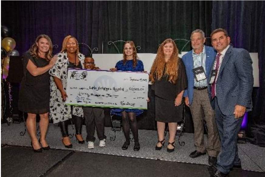
Lurie's Children Hospital donation, From L to R: